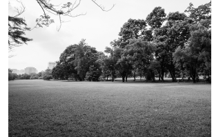
to the park